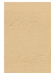
SURFACE & EDGE Hardrock Maple