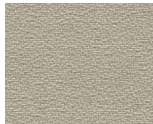
PANEL FABRIC Pebble Creek