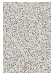
SURFACE White Nebula