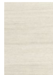
SURFACE & EDGE White Cypress